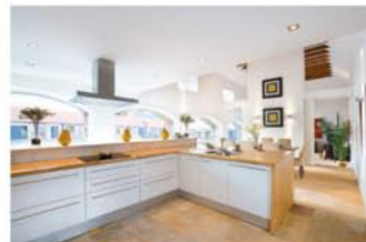
The State Of The Art kitchen at Lindifferon Court.