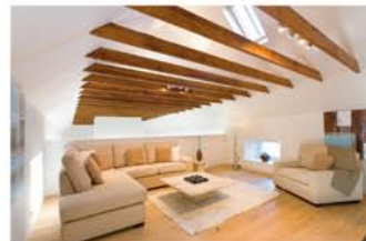
A comfortable modern L shaped latte sofa says 'kick back and relax' in the upper floor family room.