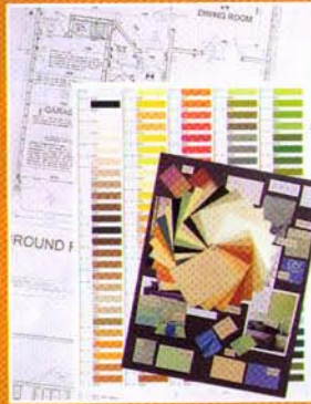
A taster of furnishings are set up and then presented to the client.

The Process in Brief Plans are submitted to XS Interiors for interior design planning and furnishing considerations. Mood boards/storyboards show an overview of the aesthetic of the interior scheme XS Interiors propose.